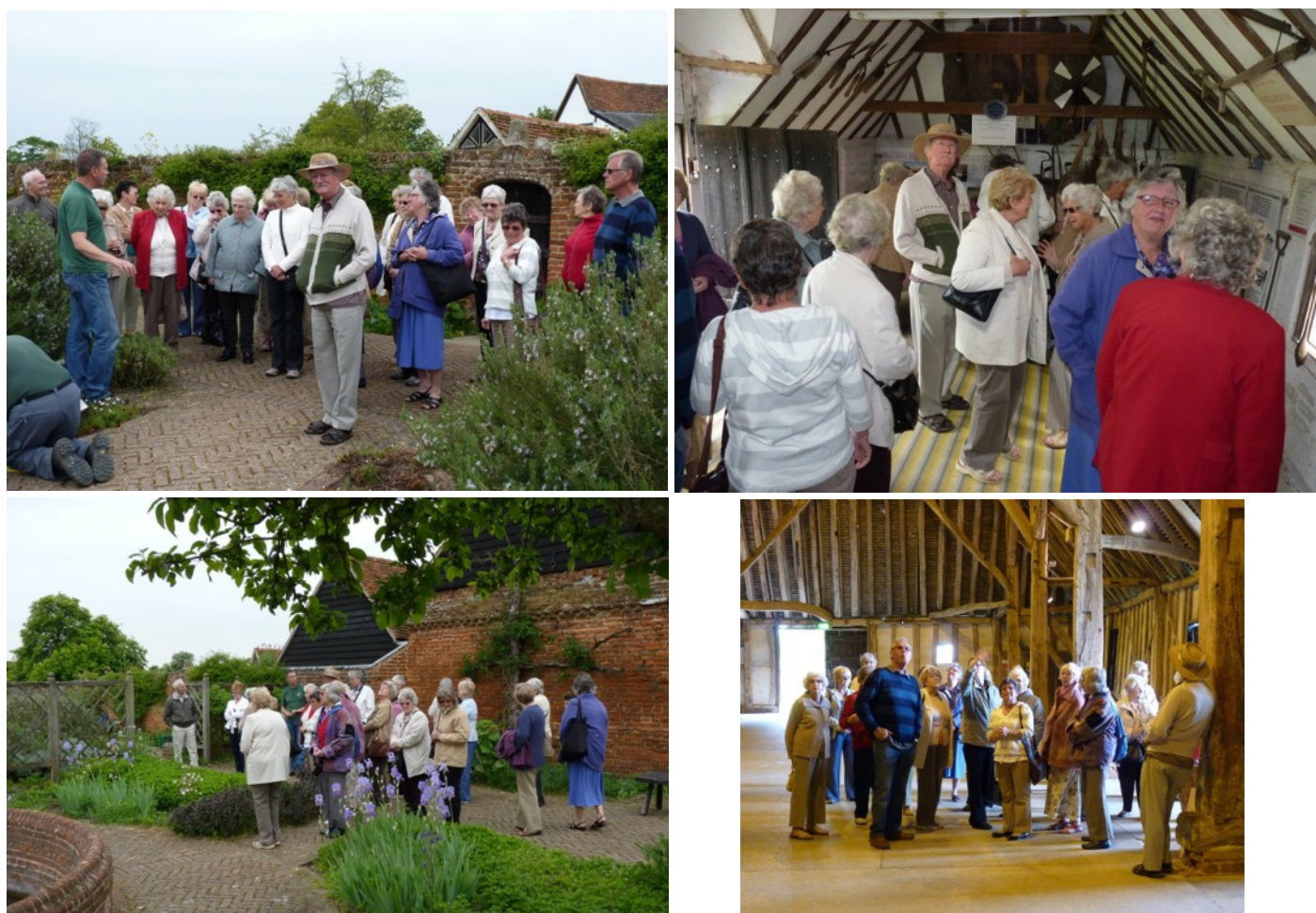
Scenes from the Town & Village History Group's visit to Cressing Temple

Group leaders and future contributors, - if you wish to be remembered in this Newsletter next time, Please note the dates at the bottom of the last page and ensure that your copy is in on time !!