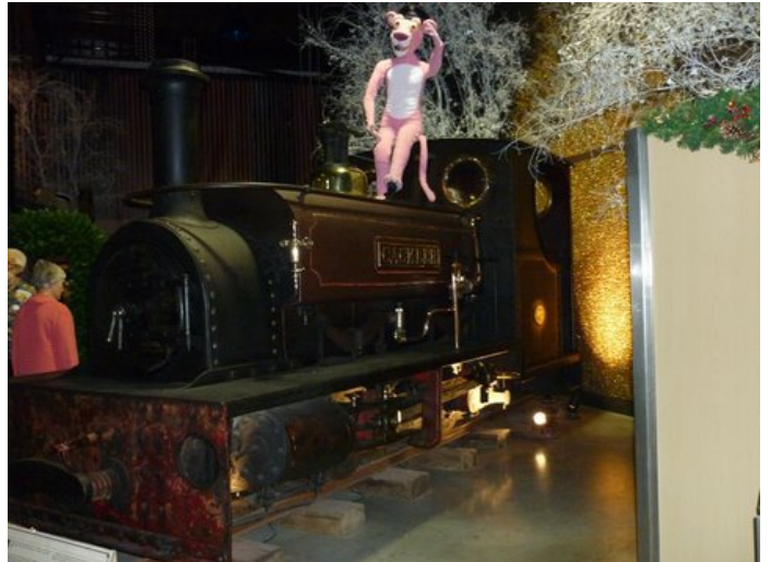
Scenes from our June Outing to the Swaffham EcoCentre and on to Thursford Steam Museum with the two tours - One behind the scenes.