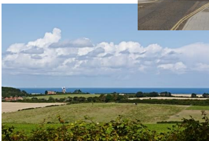
Weybourne Windmill from the train