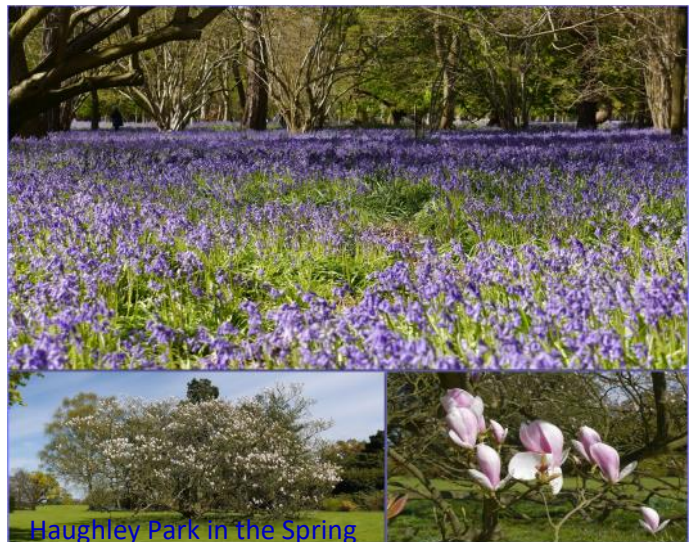
Haughley Park in the Spring