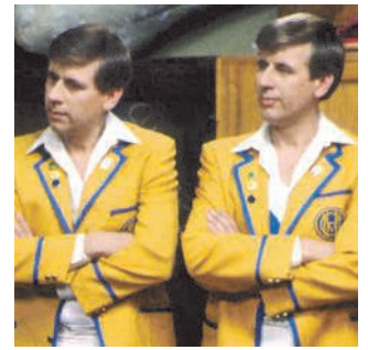
Hi Di Hi Cast