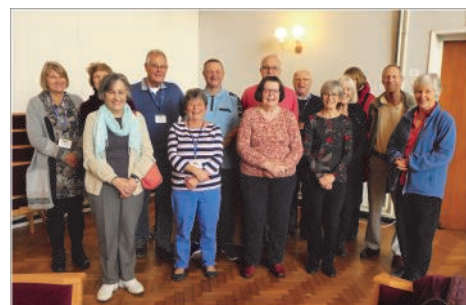
Some of our new members meeting the Committee in January