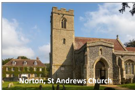
Norton, St Andrews Church