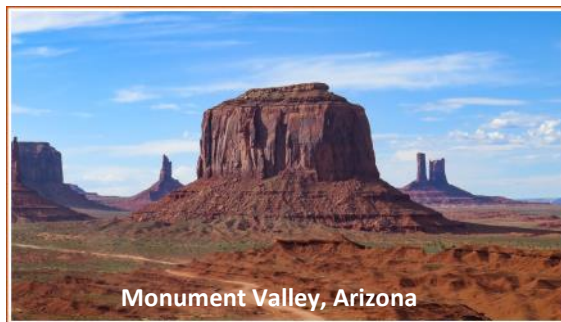
Monument Valley, Arizona