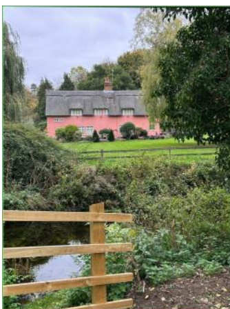
Extra pictures from the Walk & Talk Group